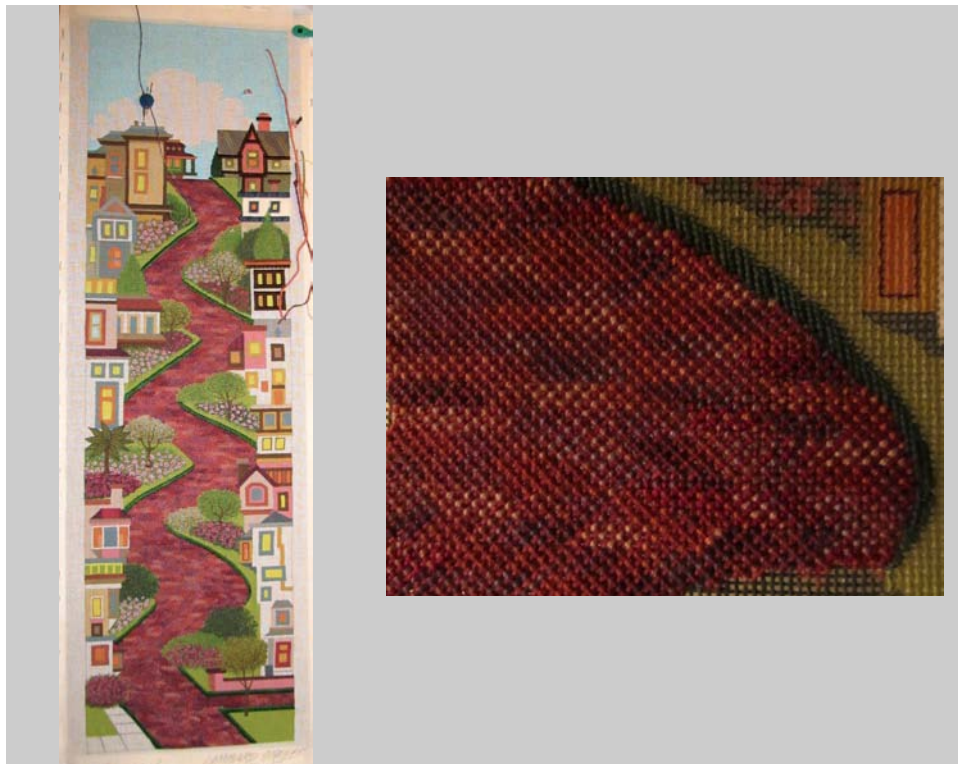
Lombard Street, San Francisco canvas with detail of Lombard street stitch on the right.