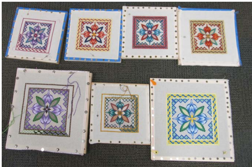
Stitch of the Month – November 2013