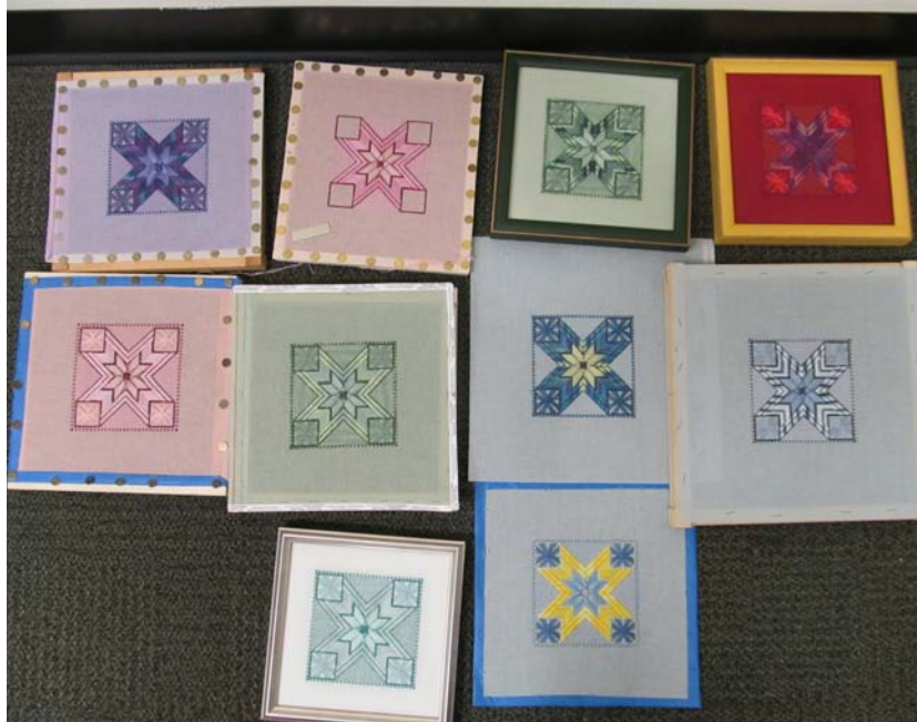
St. Margaret's Star Project – October 2013