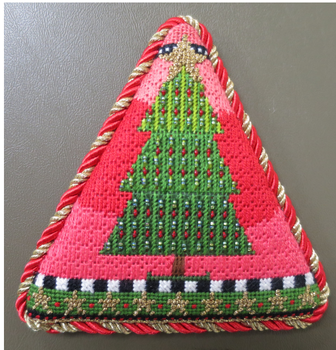
Cathryn C displays this Beaded Tree ornament on a small easel. I'm enjoying the fun colors in both ornaments on this page!