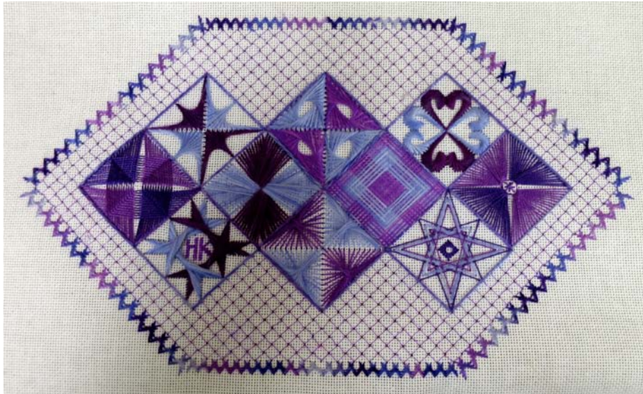
Heidi's "Flowers of Italy" shows the border done in angel wings stitches!

interesting stitch and I found it presented quite a challenge when turning the corner from straight to diagonal!