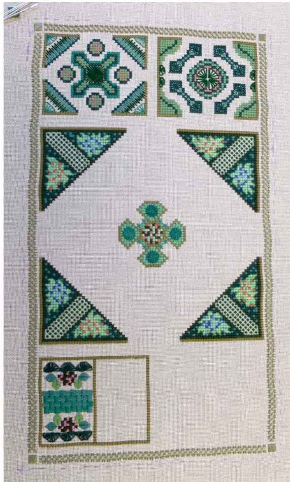
English Garden Sampler in memory of Barbara Davis

a few more volunteers for stitching. All of the threads are included in the project bag. Here's our progress: