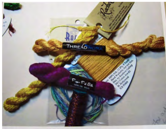
Golden Purple colorway