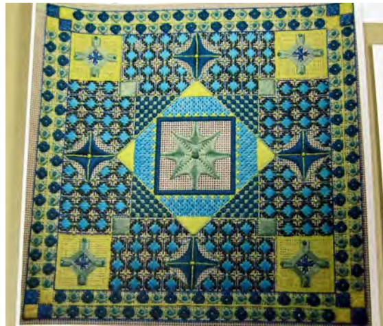
Diamond Jubilee in the Blue Teal colorway

of the class. Additional information and a sign-up form are under the Workshops Tab on the Website. The design comes in three colorways.