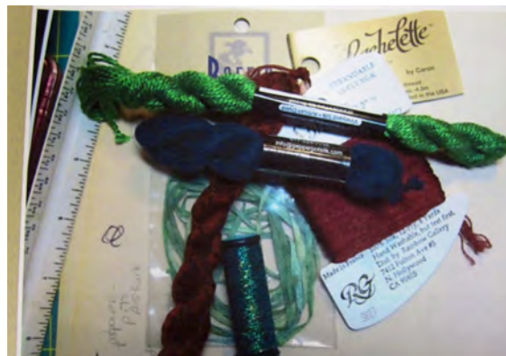
Kings Maroon (Aqua) colorway

This will be a trial to see how the workshop process works for us! I hope you will take advantage of this unique opportunity to work with a live teacher!