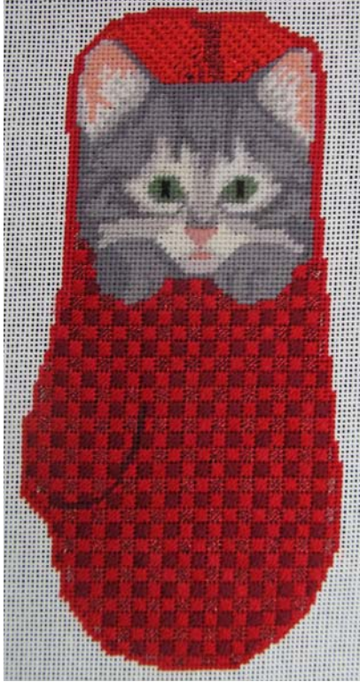
This cutie pie, "Kitten in a Mitten" was stitched by Ellen!