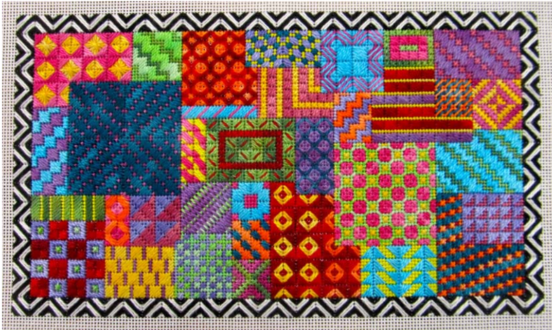
Note that Ellen changed the border to make it more compatible with Rio, another destination piece. Ellen also changed the pink thread to a slightly different color.

In any event – don't you agree that the colors are lush and the stitches make the piece move?? And isn't it fun to see two different interpretations of the same design?